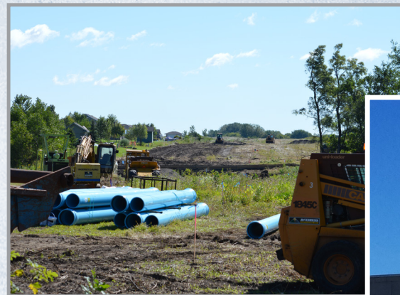
ABOVE: 19th Street SE Before Photo BELOW: 19th Street SE After Photo

The Downtown Street Lighting Project began in the spring of this year and is expected to be completed by the end of September. The project included the replacement of the existing street lighting system along Delaware and Washington Avenues between 2nd Street south and 4th Street north. The street lighting along the connecting streets between the avenues was also replaced with the project. The new lighting system included the demolition of existing system, the construction and installation of approximately 90 new light fixtures including foundations, poles and LED luminaires, new electrical conduits, wiring, control panels and junction boxes. The new lighting will provide a more uniform, reliable, and energy efficient system.