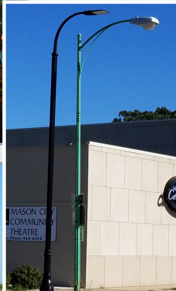
ABOVE: New & Old Streetlights