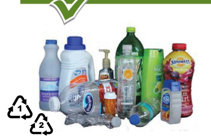
Screw-Top Plastics (with caps) & Yogurt and Margarine Tubs (no lids) #1 and #2 plastics; NOT #5