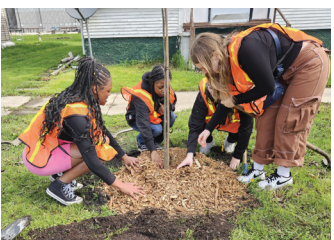
Volunteers with the iJAG Program with Mason City Community Schools helped plant trees on a beautiful morning in May, made possible by a partnership with Alliant Energy and Trees Forever