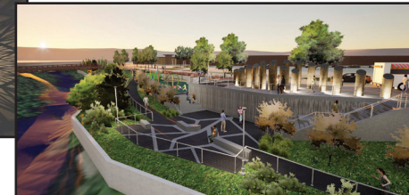
The sculpture and waterfront plaza will create a highly visible and welcoming gateway to River City.

A waterfront plaza wall will feature textured concrete highlighting the vertical language of the sculpture above. The sculpture and plaza will create a highly visible and welcoming gateway to Mason City traveling north on Highway 65.