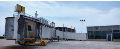
MCW's new passenger boarding bridge

Total estimated cost for the project is $18 million, a majority of which is funded by federal grants from the Federal Aviation Administration (FAA).